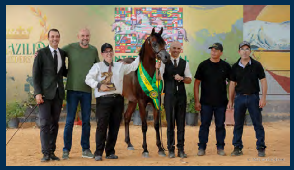
The Filly Championship saw a battle between three beautiful bays. The prevailing winner was Fabreanne HVP, bred and owned by Haras Vila dos Pinheiros, who is by the accomplished international sire Dominic M and out of the iconic RD Fabreanna, also the mother of World Champion