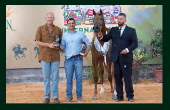
Silver Champion Jr Filly - Hylihandra Sirajj JM