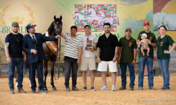
Bronze Champion Colt - Sir Phames HBV