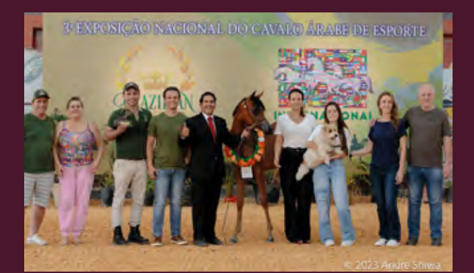
Top - VV Abilah