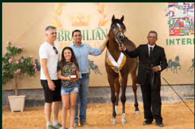
Bronze Champion Colt - Gallax D'Ambition JM