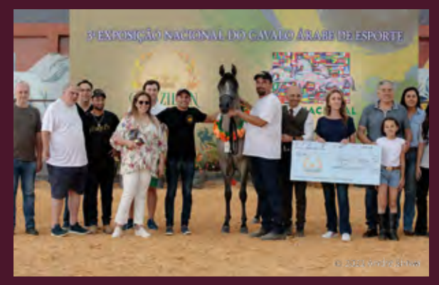
Top - FT Simphonia