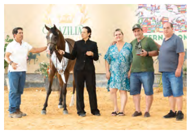
Silver Champion Mare - VV Yasmin

of the reigning U.S. National Champion El Jahez WH,