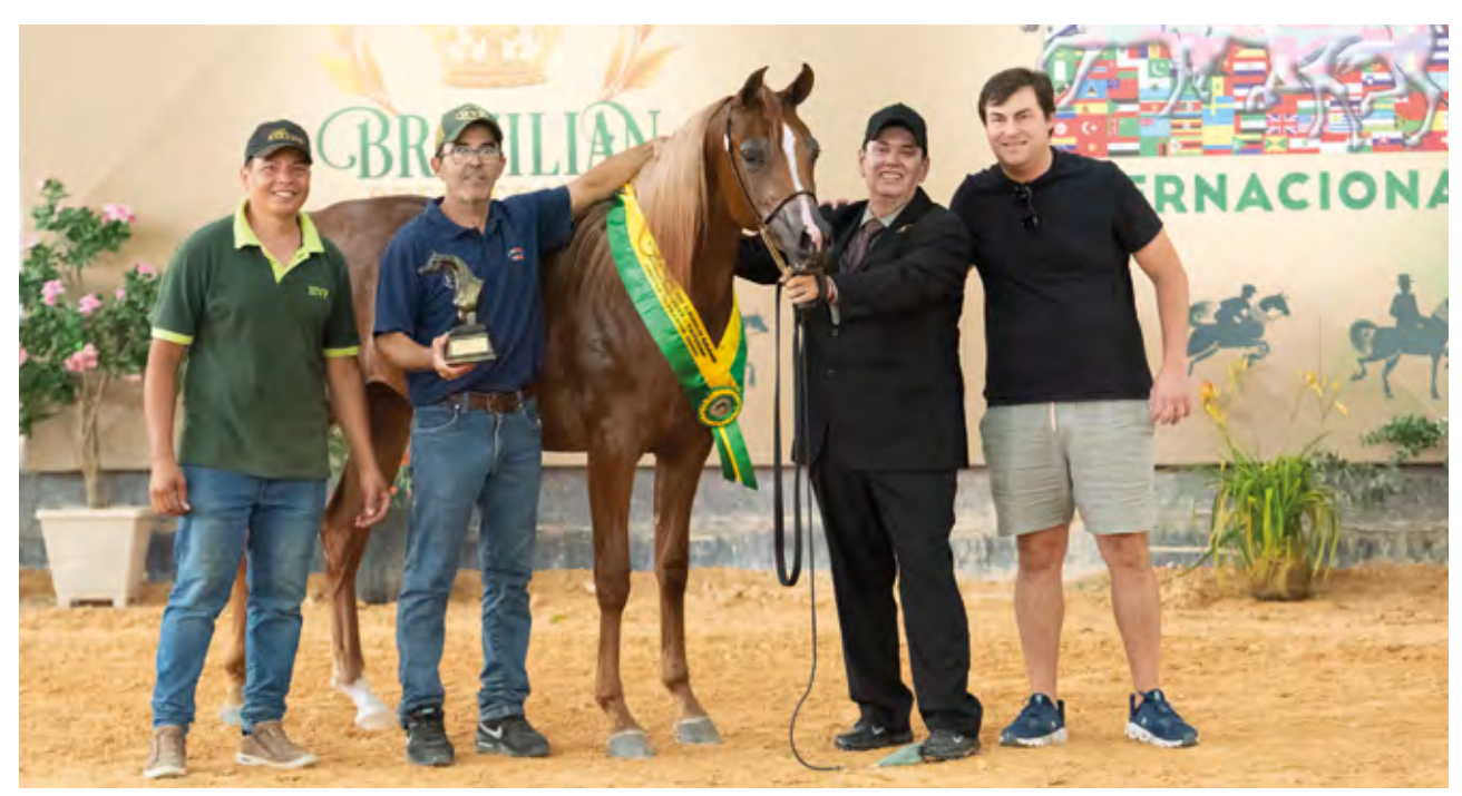
Gold Champion Filly - Saryanna HVP