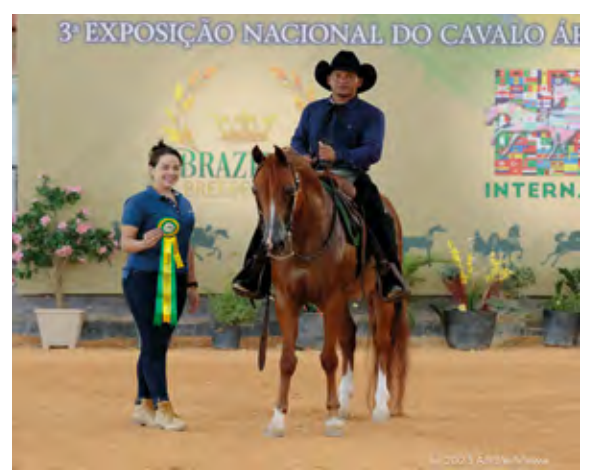
Wester Pleasure Senior Gold - Xhermess D Pscore JM