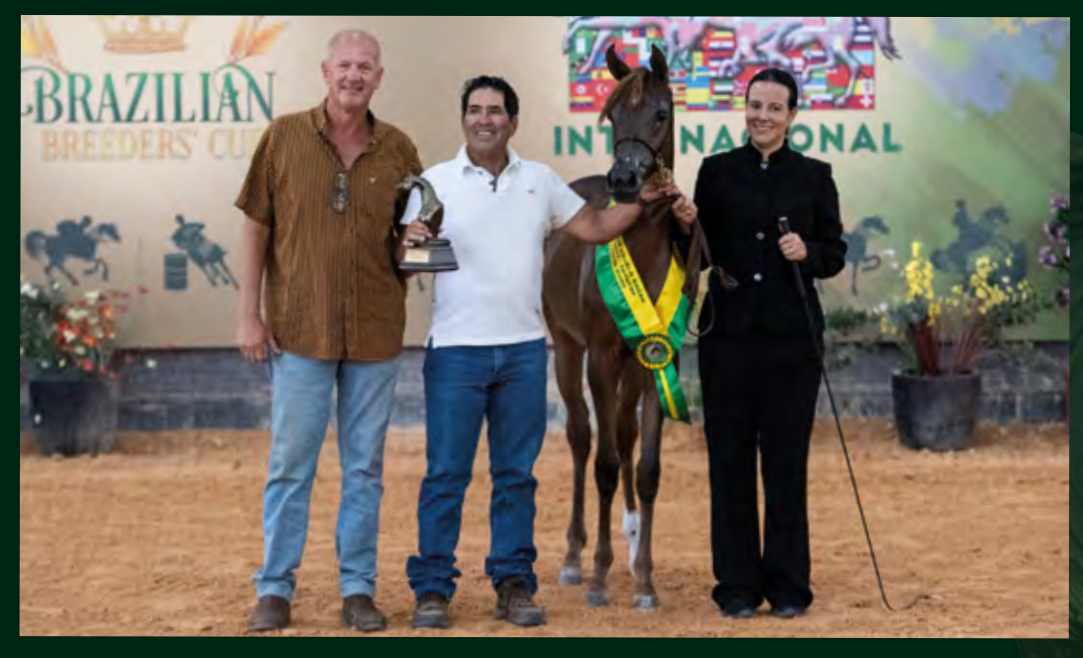
Gold Champion Jr Filly - Princess Valente FWM

The Gold Junior Champion Filly was Princess Valente