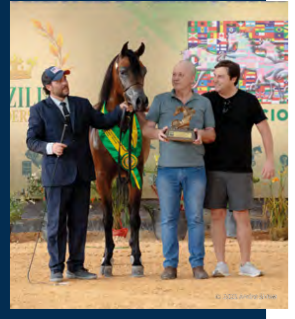
Gold Champion Mare - Caranda Lulikah