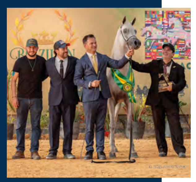
Gold Stallion - Lughan HVP