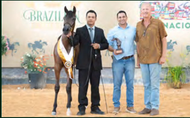
Bronze Champion Jr Filly - Ibelissima Quasim JM