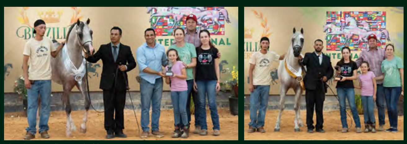
Silver Champion Stallion - Fattaly D'ali JM

Bronze Champion Stallion - Prince Magnum JSZ