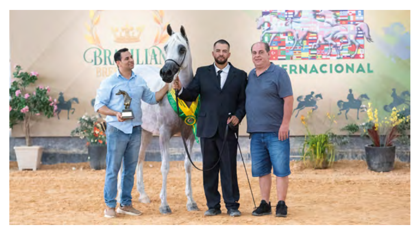
Gold Champion Mare - Ystopa Di Justice JM