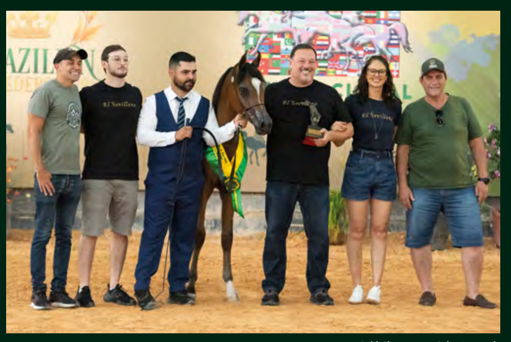
Gold Champion Jr Colt - AF Borak

Brazilian National Champion Wandan el Madan, bred and owned by Haras Lone Star. The Bronze Champion, Hazzeer di Cash JM, bred and owned by Haras JM, is proof that his sire, National Silver Champion Stallion, Cash del Tino JM is quickly becoming one of El Tino's greatest sons in Brazil and a strong candidate to occupy the chief sire spot in the superlative hall of stallions of Haras JM.