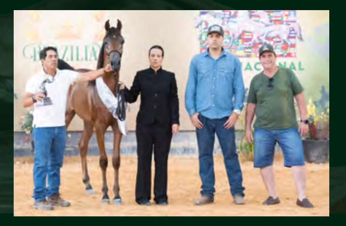
Silver Champion Jr Colt - Sir Lucius FWM