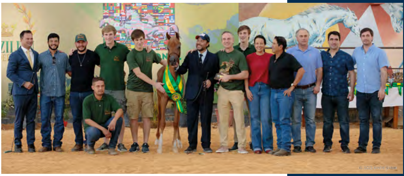
Gold Champion Jr Filly - Bonitah Serondella

he following day after the Brazilian Breeders' Cup is the time for the International Show to happen. Though judged by the same panel, the comparative system is used this time around. Twenty-one exhibitors participated of the show that offered classes in halter as well as in performance.