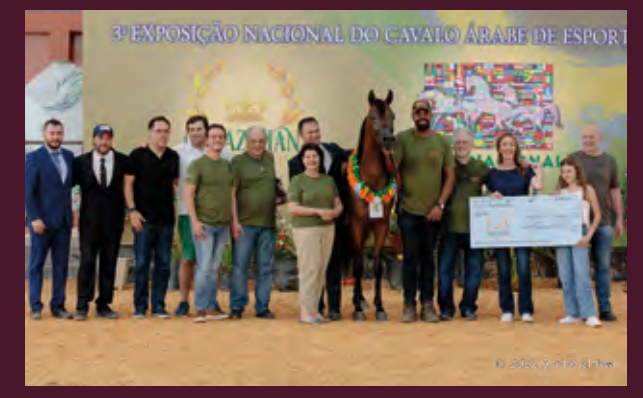
Top - RFI Intense