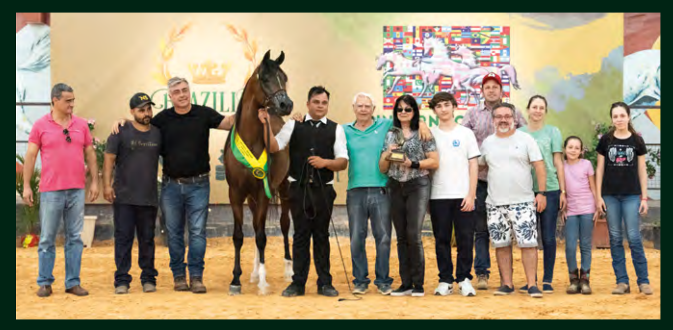
Gold Champion Stallion - Virtus HEC