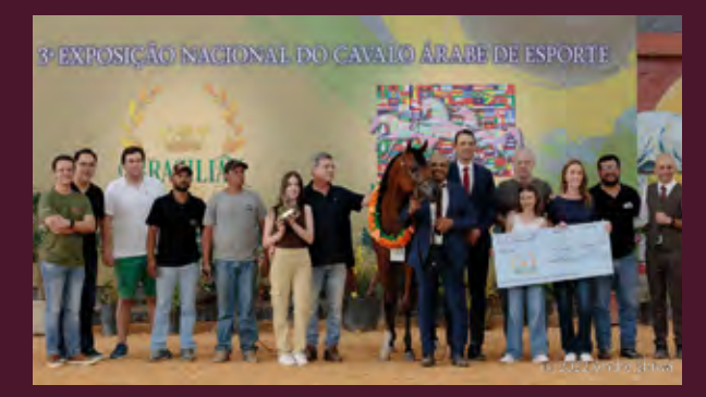
Top - Koral LA