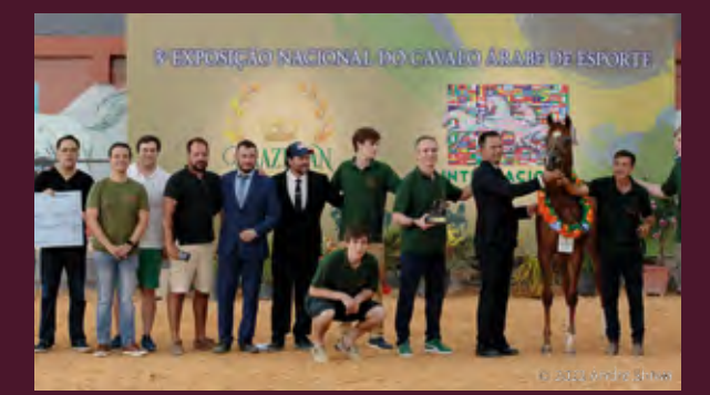
Top - Acqua Serondella