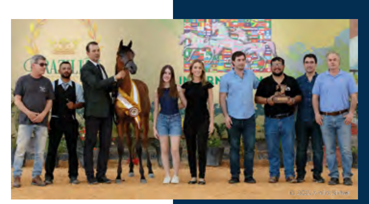
Bronze Champion Jr Filly - Luka LA