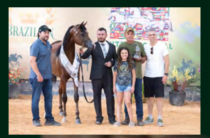
Silver Champion Colt - RFI Marquis