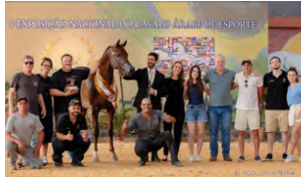
Bronze Champion Stallion - Zhafir HVP