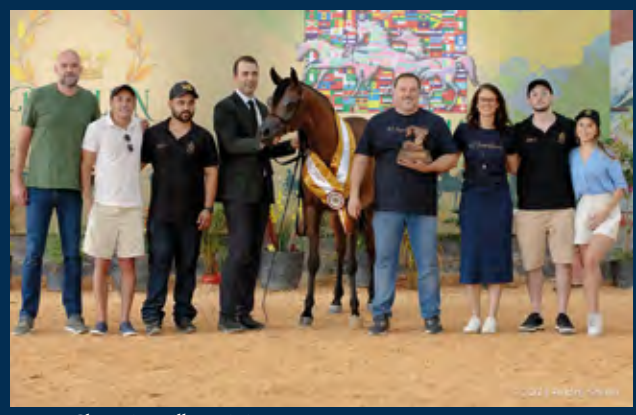
Bronze Champion Filly - Mistic Rose HVP

Vila dos Pinheiros was the Bronze Champion Mistic Rose HVP, owned by Haras El Sevillano. She is a full sister to the Scottsdale Champion Filly Mistic Dominic HVP.