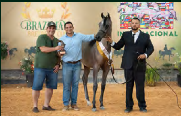
Bronze Champion Jr Colt - Hazzeer Di Cash JM