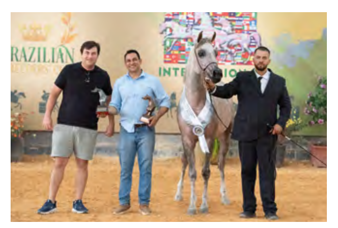
Silver Champion Filly - Ghidara Di Sirajj JM